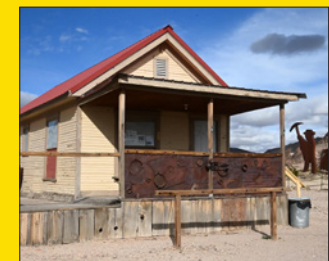
Goldwell Visitor Center

A "medicine wheel" is an ancient and sacred symbol used by many Native American tribes. The purpose is for participants to walk slowly to the center while praying or meditating for healing powers.