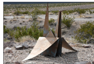
1000 in 1 Cranes (2016) Cierra Pedro

Originally created as an artist-in-residence project at the Lied Discovery Children's Museum in Las Vegas, the couch was rescued, relocated and rehabilitated at Goldwell in 2007 and was maintained until unrepairable in 2022.