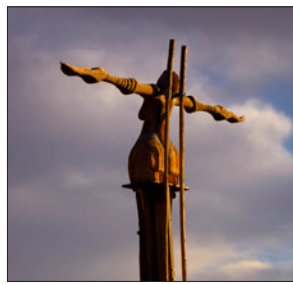
*Icara (1992) Dre Peeters

Refers back to classical Greek sculpture while maintaining a pixelated presence in the high-tech world of the 21st century.