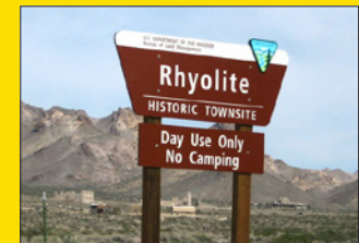
Rhyolite Ghost Town 1904 - 1924