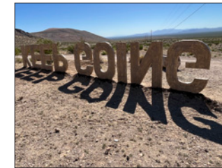
Keep Going (2023) Michelle Graves

The title meaning 'doorway' in Italian, is a meditation on restoration and transformation, and the hidden power that lies within us all. It is modeled after a beta sheet, a critical substructure that makes up the protein catalase.