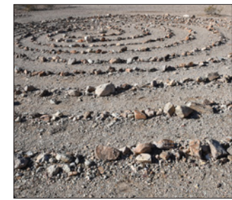
"Medicine Wheel" made by visitors over time