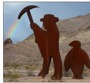
*Tribute to Shorty Harris (1994) Fred Bervoets

This plaque is one of more than 120 placed around the world commemorating places and events of importance in a parallel universe that includes in its embrace our linear world. Learn more about this global storytelling project at www.kcymaerxthare.com