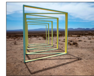
Portone (2021) Amanda Phingbodhipakkiya

The 1,000 in its title refers to the 1,000 small paper cranes that are strung together in a "senbazuru," a traditional gift at weddings and sometimes for newborn babies. The size of the metal crane is calculated to roughly equal the total size of the 1,000 paper cranes, so it is 1,000 in 1.