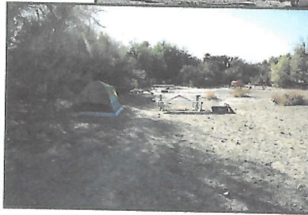
SUNSET CAMPGROUND (above) FURNACE CREEK CAMPGROUND (left)

For more information please visit: nps.gov/deva/getinvolved/volunteer