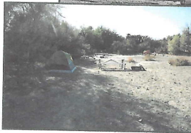
SUNSET CAMPGROUND (above) FURNACE CREEK CAMPGROUND (left)

For more information please visit: nps.gov/deva/getinvolved/volunteer